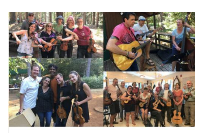
July 9-15 and July 16-22, 2022 March 12, 2022 Palo Alto, California California Coast Music Camp 2022 Registration Now Open