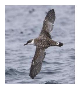
* A sea bird like a puffin

** An oilskin hat with a long bill in back