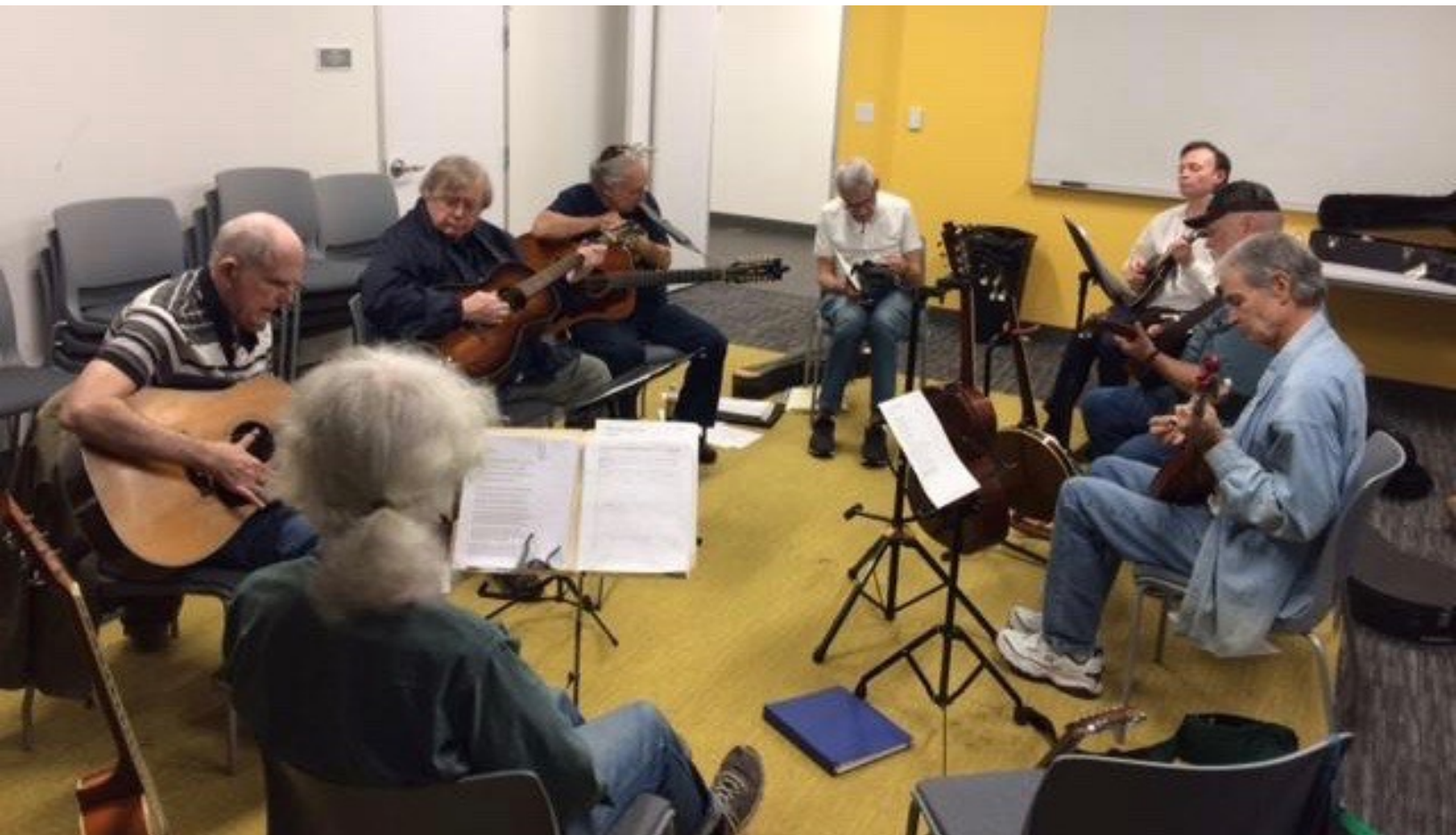
Another lovely Monday evening of warm and interesting musical sharing.