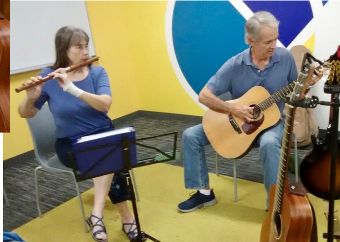
Another Monday evening of relaxed musical sharing.