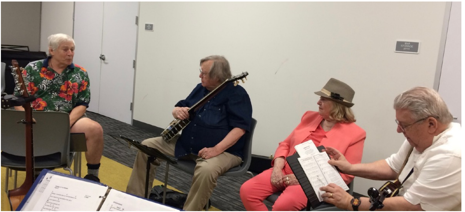
Our first Monday song circle is always relaxed musical fun.