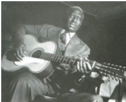
LEAD BELLY AROUND 1944

Our upcoming January Second Saturday concert January 13 (see front page) is another opportunity to further our education about Lead Belly, the blues and the extraordinary contributions African-American artists have made to our folk music heritage.