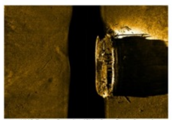
HMS Erebus Remains (Side-Scan Sonar Image)