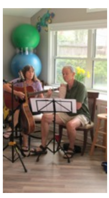
and enjoy spontaneous musical collaboration.