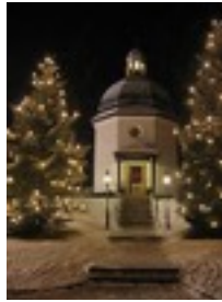
Silent-Night-Chapel in Oberndorf, Austria

The song was first performed on Christmas Eve 1818 at St Nicholas parish church in Oberndorf, a village in the Austrian Empire on the Salzach river in present-day Austria. A young priest, Father Joseph Mohr, had come to Oberndorf the year before. He had written the lyrics of the song "Stille Nacht" in 1816 at Mariapfarr, the hometown of his father in the Salzburg Lungau region, where Joseph had worked as a co-adjutor. The melody was composed by Franz Xaver Gruber, schoolmaster and organist in the nearby village of Arnsdorf. Before Christmas Eve, Mohr brought the words to Gruber and asked him to compose a melody and guitar accompaniment for the Christmas Eve mass. [2] (Legend suggests that the reason for composing on guitar was that the organ was broken, but Gruber's written account does not mention this.) Together they performed the new carol during the mass on the night of 24 December.