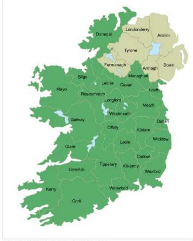
The 32 traditional counties of Ireland